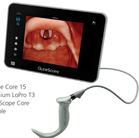
GlideScope Core 15 with Titanium LoPro T3 and GlideScope Core Video Cable