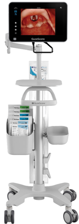
GlideScope Core 15 with GlideScope Core Premium Workstation